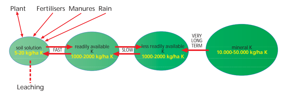
Fig 1 Simplified K cycle for crops & soils indicating content of K in different forms

Plant roots take up K, like other nutrients, from the soil solution which is in the pores between soil particles. Actively growing crops have a large demand for K, cereals as much as 5 kg/ha each day. However, the roots of annual arable crops do not have time to exploit the whole volume of soil. So it is essential that K in the soil solution is rapidly replenished from the supply within the soil near to where it is being taken up by the roots.